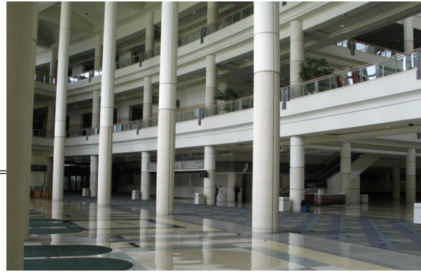
WEST BUILDING LEVEL TWO - WEST C LOBBY - CENTER COLUMNS 20 TYPICAL AT MAIN ENTRANCE