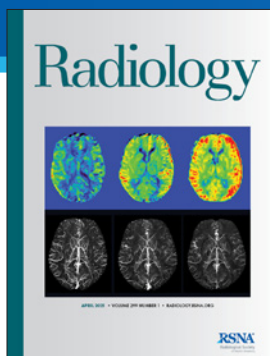
Print and Online

Print promotional opportunities are available in Radiology and RadioGraphics . Digital promotional opportunities are available for all five journals.