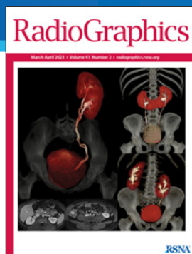
Print and Online