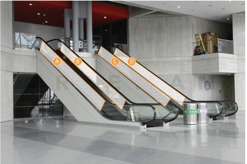
Note: There are (4) available balustrades A, B, C, D